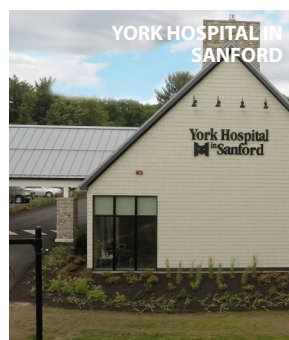
YORK HOSPITAL IN SANFORD