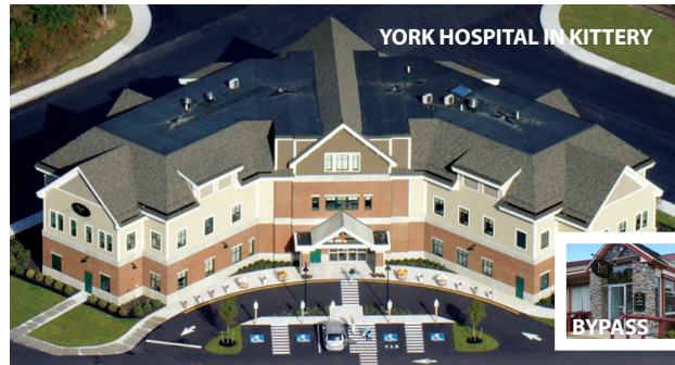
YORK HOSPITAL IN KITTERY