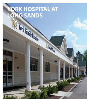
YORK HOSPITAL AT LONG SANDS