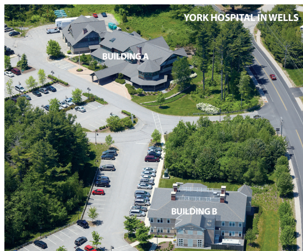
YORK HOSPITAL IN WELLS