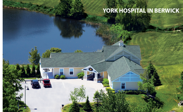
YORK HOSPITAL IN BERWICK